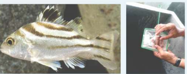
(Fisheries Research & Training Center, JAU, Mahuva)

Fish farmers rearing Terapon jarbua fiv (Crescent banded fish) tiger are recommended to utilize feed containing 40 % crude protein at the rate of 10 % of fish body weight, twice a day, for higher growth and survival rate for a period of 60 days.