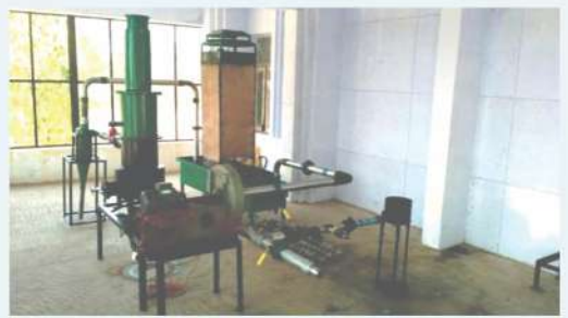
[Dept. of Renewable Energy Engg., CAET, JAU, Junagadh]

The farmers and entrepreneurs are recommended to use the gasifier designed by the Junagadh Agricultural University having thermal capacity 80 MJ/h for production of biochar and thermal energy. The maximum gasification efficiency -75.59 % and biochar - 24.91% are obtained at gas flow rate 22 Cu. m/h by using shredded cotton stalk as feed stalk.