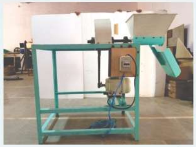
[Agricultural Research Station, JAU, Amreli]

The sesame producers and processers are recommended to use a low cost sesame dehuller developed by Junagadh Agricultural University for dehulling of sesame seed. The sesame seeds are required to be soaked in water for 120 min. and then dehulling to be carried out for 6 min in developed machine at 150 rpm dehulling speed for getting maximum efficiency (79.29 %). The estimated sesame dehulling benefit cost ratio by this machine is 1.95.