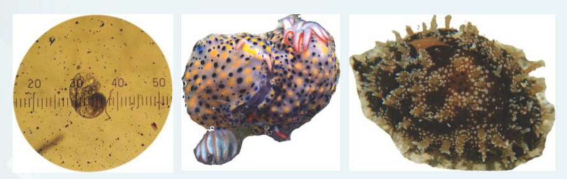
(Fisheries Research Station, JAU, Sikka)