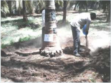
(Fruit Research Station, JAU, Mangrol)

The farmers of Saurashtra are interested organic cultivation of coconut cv. West Coast Tall (WCT) are recommended to apply FYM @ 60 kg per plant or FYM at 15 kg + Castor cake at 2.25 kg +Vermicompost at 8 kg + Neem cake at 2.25 kg per plant to get higher nut yield and improved organic carbon and microbial status in soil under saline irrigation condition (EC 10-14 dSm<sup>-1</sup>).