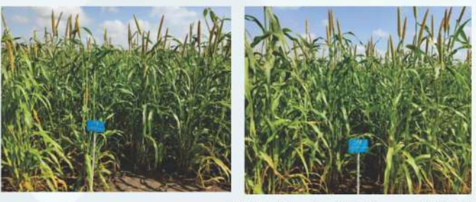
(Main Pearl millet Research Station, JAU, Jamnagar)

The farmers of Gujarat growing pearl millet in kharif season are recommended to do hand weeding at 3<sup>rd</sup> and 5<sup>th</sup> weeks after sowing for effective weed management and achieving higher grain yield and net realization.