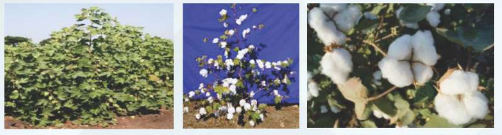
[Cotton Research Station, JAU, Junagadh]